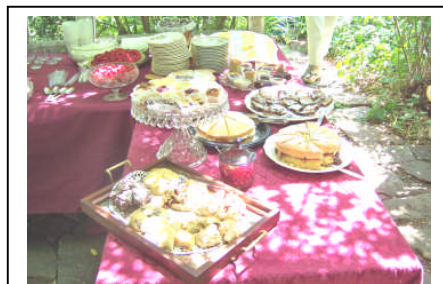
And it tasted as good as it looks