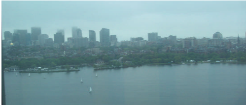
Looking cross the Charles River to Boston on a Claude Monet Evening

Our by-laws require us to meet on the last Thursday of May, and every member must be sent a notice of the meeting at least seven days before the date. It has been held at various places in the past, from the USS Constitution to the Union Club. More recently the Consul-General has graciously invited us to use the Consulate's offices, which are ideal for the purpose, with a large area for socializing before the meeting, a separate space for the meeting itself, and a magnificent view across the Charles River to Boston. This combination, together with a vigorous invitation campaign and two fascinating speakers, resulted in a record attendance this year of over 80 people.