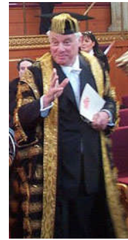
Patten the Magnificent

Commenting on the role of Chancellor, he said it was mostly ceremonial, and the Vice-Chancellor did all the work. A former Chancellor, when asked what, then, was the point of having a Chancellor at all, answered that 1) you could not have a Vice-Chancellor if you did not also have a Chancellor, and 2) impotence was assuaged by magnificence. There will always be an Oxford.