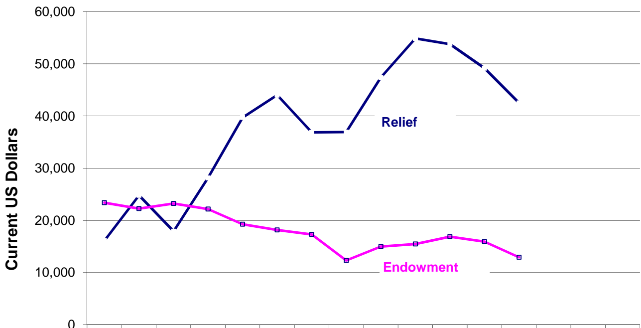
BCS Relief Outlays vs. Endowment Income 1996-2008 (current US dollars)

We include this information not just for the fun of whinging, nor to justify further passing of the plate, but simply to explain why we are so grateful for the generous help we continue to receive from the membership. Thank you!