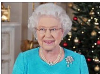
The Queen Broadcasts at Christmas

Each year that passes seems to have its own character. Some leave us with a feeling of satisfaction, others are best forgotten. 2009 was a difficult year for many, in particular those facing the continuing effects of the economic downturn.