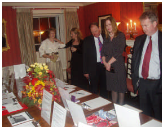
The Table Is Laid for the Silent Auction