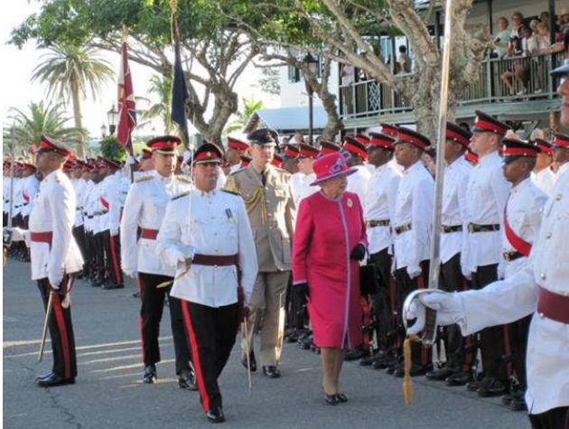
The Queen in Bermuda

During Thanksgiving Week, a very senior member of the Executive Committee was in Bermuda. As he emerged from the azure Gulf Stream, dripping wet in his swimming trunks, he encountered the Monarch as she reviewed the Bermuda Army. Neither of them seemed to know exactly what protocol should be followed at such an interface, but we understand that they both nodded to each other, in a civil kind of way, and then went about their lawful occasions.